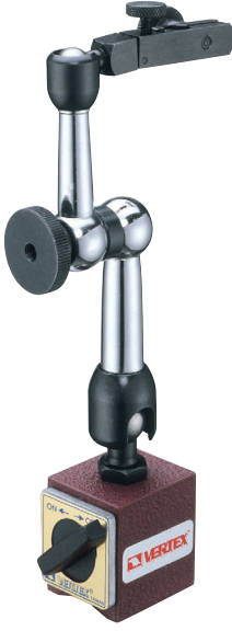
SİPARİŞ NO. VMF-112 MINİ MANYETİK AYAK