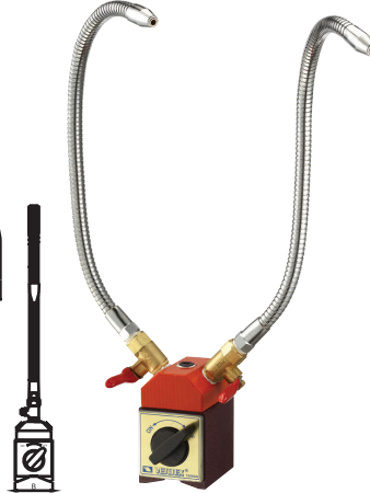
SİPARİŞ NO. VMH-64 MANYETİK AYAKLI METAL SULAMA HORTUMU ( 2 HORTUM)