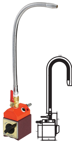
SİPARİŞ NO. VMH-63 MANYETİK AYAKLI METAL SULAMA HORTUMU (1 HORTUM)