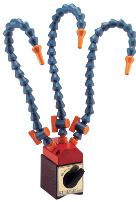
SİPARİŞ NO. VMH-62 MANYETİK AYAKLI PLASTİK SULAMA HORTUMU (3 HORTUM)