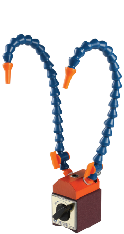
SİPARİŞ NO. VMH-54 MANYETİK AYAKLI PLASTİK SULAMA HORTUMU (2 HORTUM)