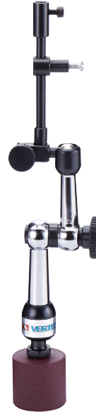
SİPARİŞ NO. VMF-102B MINİ DELÜKS UNIVERSAL MANYETİK AYAK