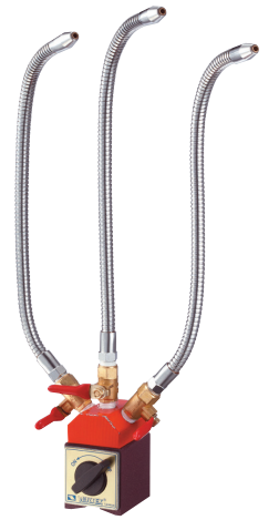
SİPARİŞ NO. VMH-65 MANYETİK AYAKLI METAL SULAMA HORTUMU (3 HORTUM)