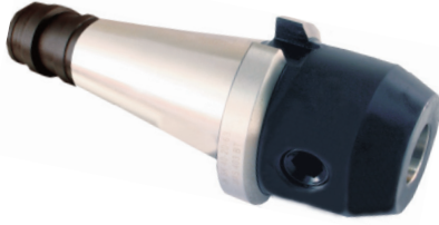
DIN 1835-B VELDON CİVATALARI İLE BİRLİKTE TESLİM EDİLİR.